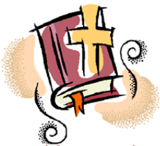
Faith Formation Registration